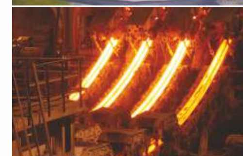
TIG FILLER WIRES